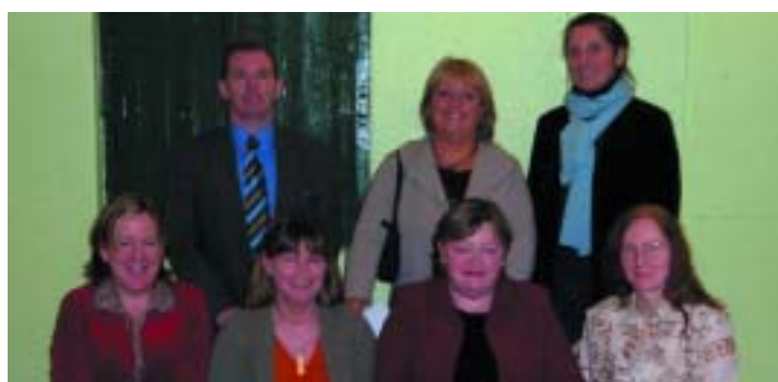
Midland Region Members at planning day in Tullamore Dew Heritage Centre, Co Offaly