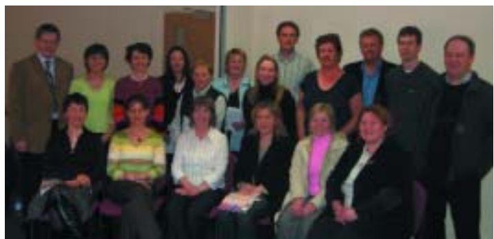
Southern Region members at Brain Storming Day in St. Joseph's Training Centre, Charleville, Co Cork