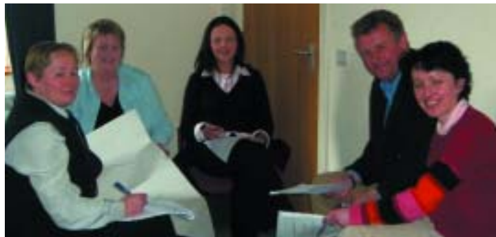
Southern Region Members working on strategic plan

In January 2005 the IASE Strategic Planning subcommittee set out the terms of reference for the consultation process and the five year plan, this was approved by the national executive and work commenced immediately.