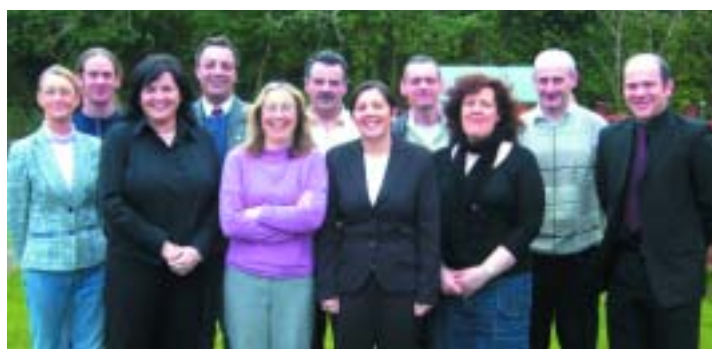
North West Region members at IASE planning session in the Cleary Centre, Donegal Town