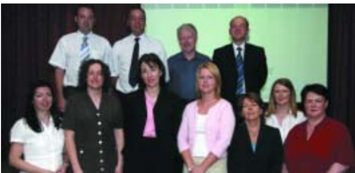
North West and Western Region Members at AGM - 13th July 2005