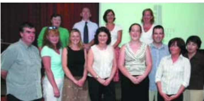
Midland Region Members at IASE AGM and Information Day (July'05)