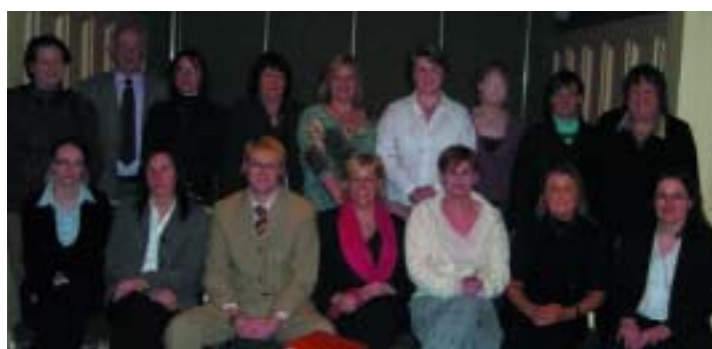
North East Members at 1st meeting of the 1st North East Region Committee (Jan '05)