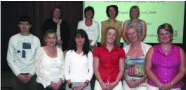
Southern & North East Region Members at AGM and Information Day, Tullamore, Co Offaly