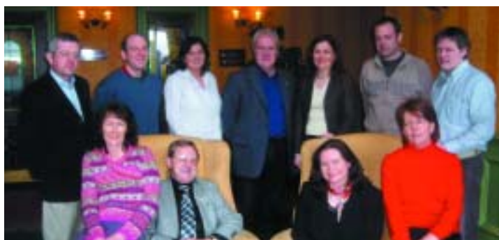
National Executive 2004/2005 at THINK TANK for strategic plan in Geesala, Co Mayo