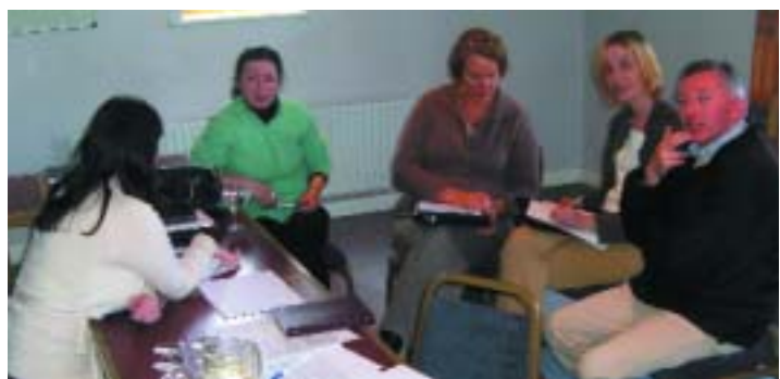
Western Region Members working on strategic plan