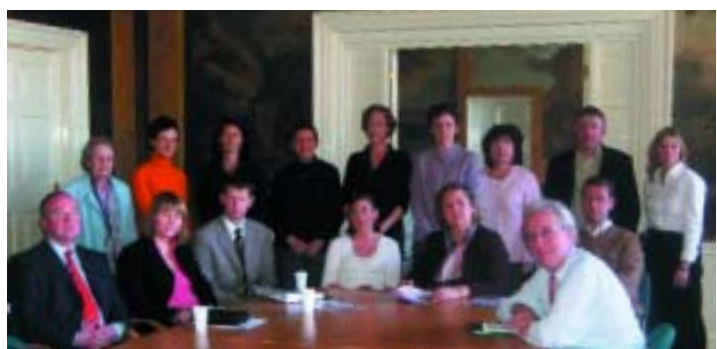
Eastern Region Members at planning day in St. Michael's House, Dublin