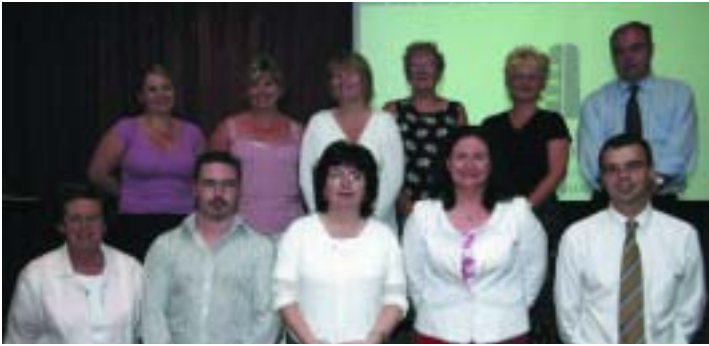
Eastern Region Members at IASE AGM – 13th July 2005