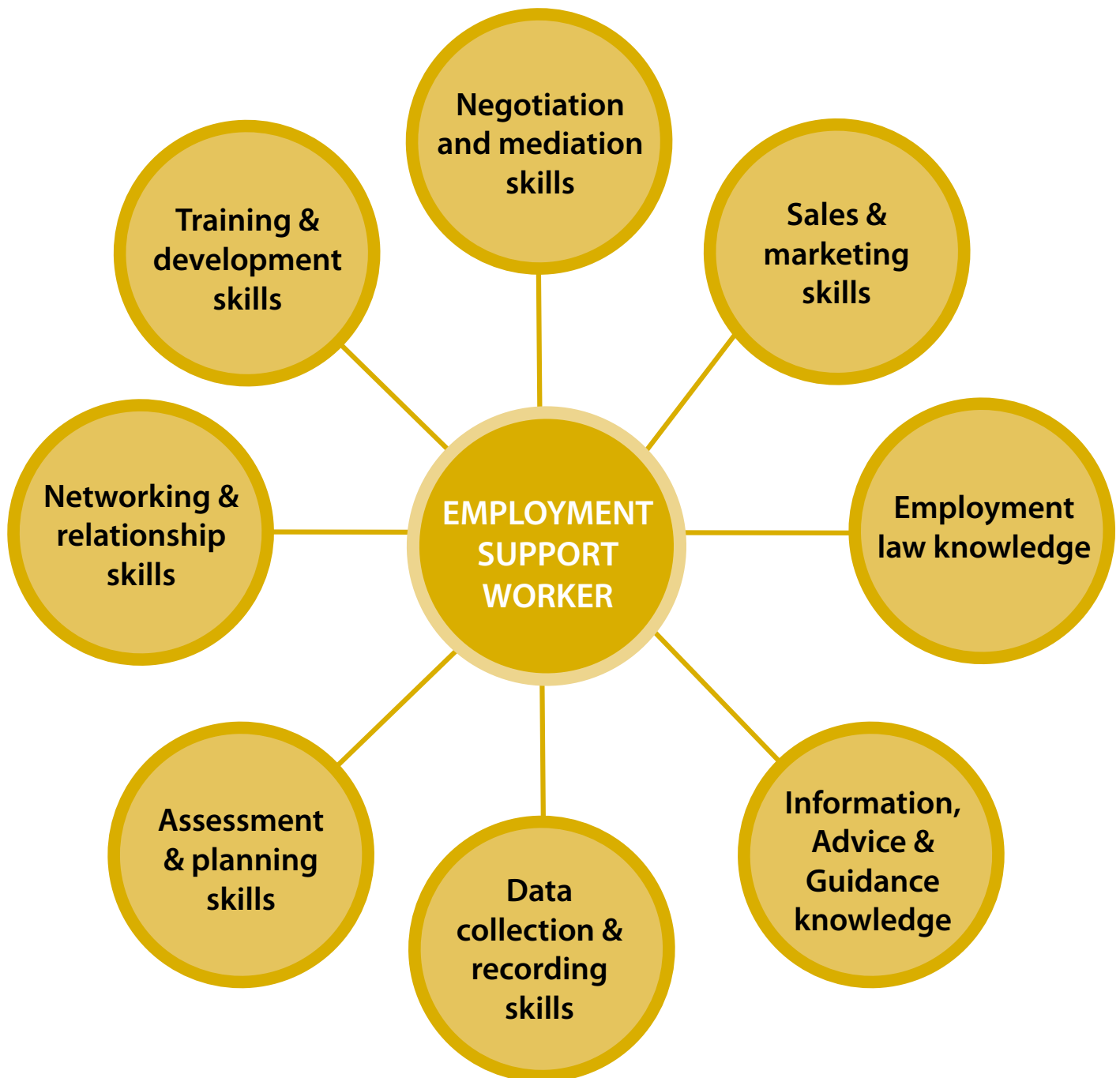
Figure 1: Illustration of the various roles associated with employment support

Staff may enter the profession from a wide range of backgrounds and may or may not have relevant qualifications. Employment Support Workers should be able to gain specialist qualifications according to their national qualification frameworks but a qualification should not necessarily be a pre-requisite to entering the profession. Indeed, having the right attitudes is the most important attribute of Employment Support Workers.